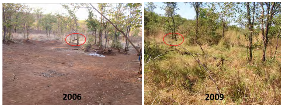
Land in Zimbabwe, bare for decades, restored in three years through holistic planned grazing.