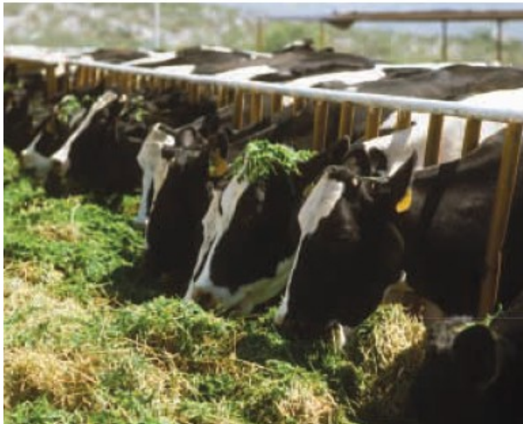
Dairy cattle feeding on fodder in open stable. La Loma, Lerdo, Durango – Mexico 1990, © FAO/15228/A. Conti (LLS, p 96)

The following photograph illustrates what happens when an ecosystem is broken into pieces. The animals are not only feeding without their normal movement on the land, but they are eating grasses isolated from the soil. When they "recycle" the grasses, the manure has nowhere to go where soil life forms will process it to perform their many beneficial functions. Soils which are thus impeded lose vital processes which, in an intact ecosystem, would include stable storage of carbon from photosynthesis, scrubbing of methane from the atmosphere by methanotrophic bacteria, feeding a universe of inter-related soil biota essential for a healthy grassland ecosystem, and nourishing the new growth of grasses to begin the cycle anew.