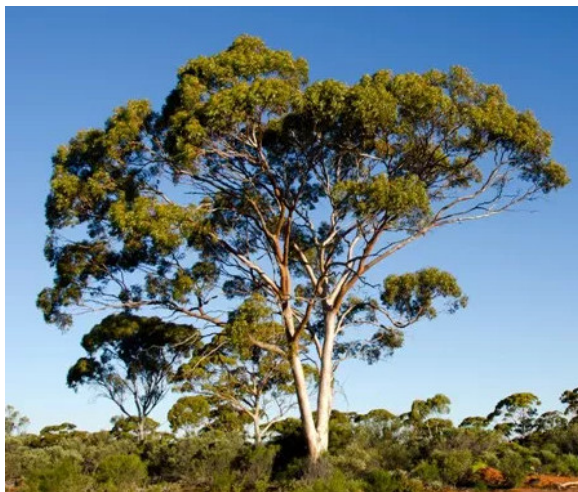
Beneficial Eucalyptus

It's another shining example of the movement to redefine the meaning of "City," working towards local-based nourishment and sustainability in urban settings.